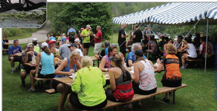
Post-ride party at Camp/Quad