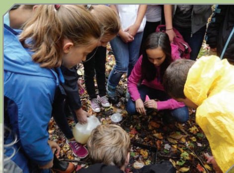
Students looking for earthworms

Many thanks to Quad/Graphics for their long-term stewardship of Camp/Quad, a 325-acre property under a conservation easement with Tall Pines Conservancy. They have been very generous in sharing this important resource for educational opportunities and as a venue for events large and small. ▲