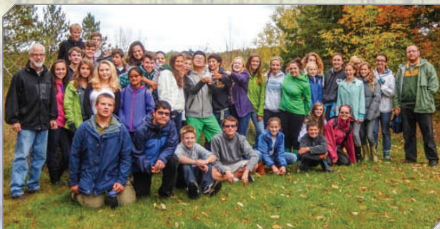
ULS students at Camp/Quad