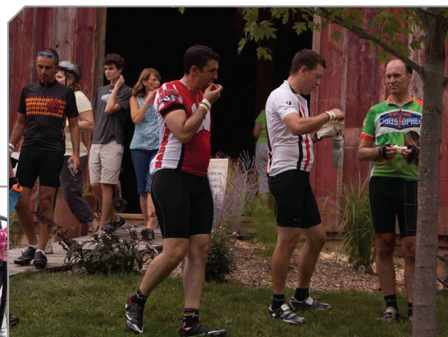
Serenity Farm rest stop